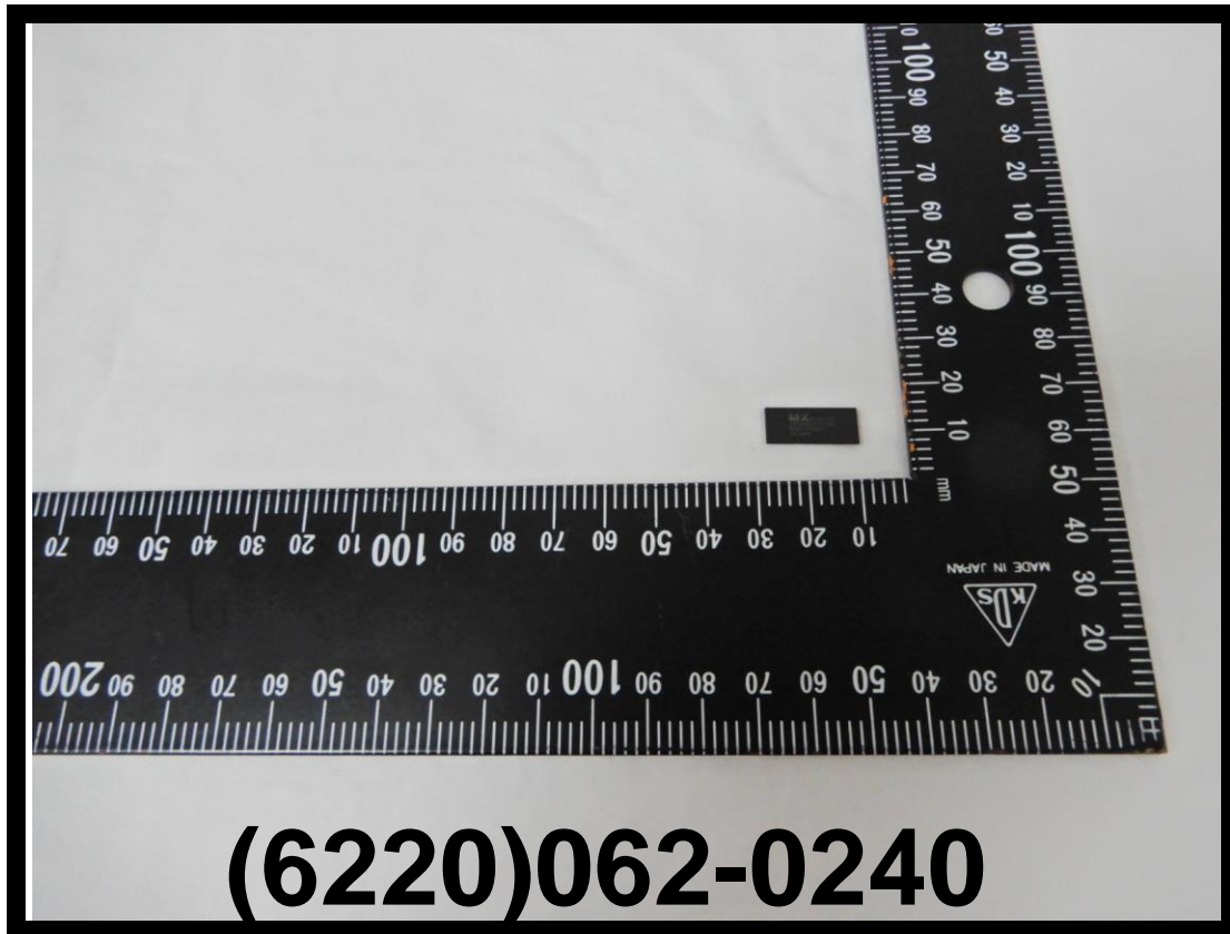
Photo of the Submitted Sample 委送样品照片

Lab No. : (6220)062-0240 Date : March 10, 2020 Page : 7 of 10