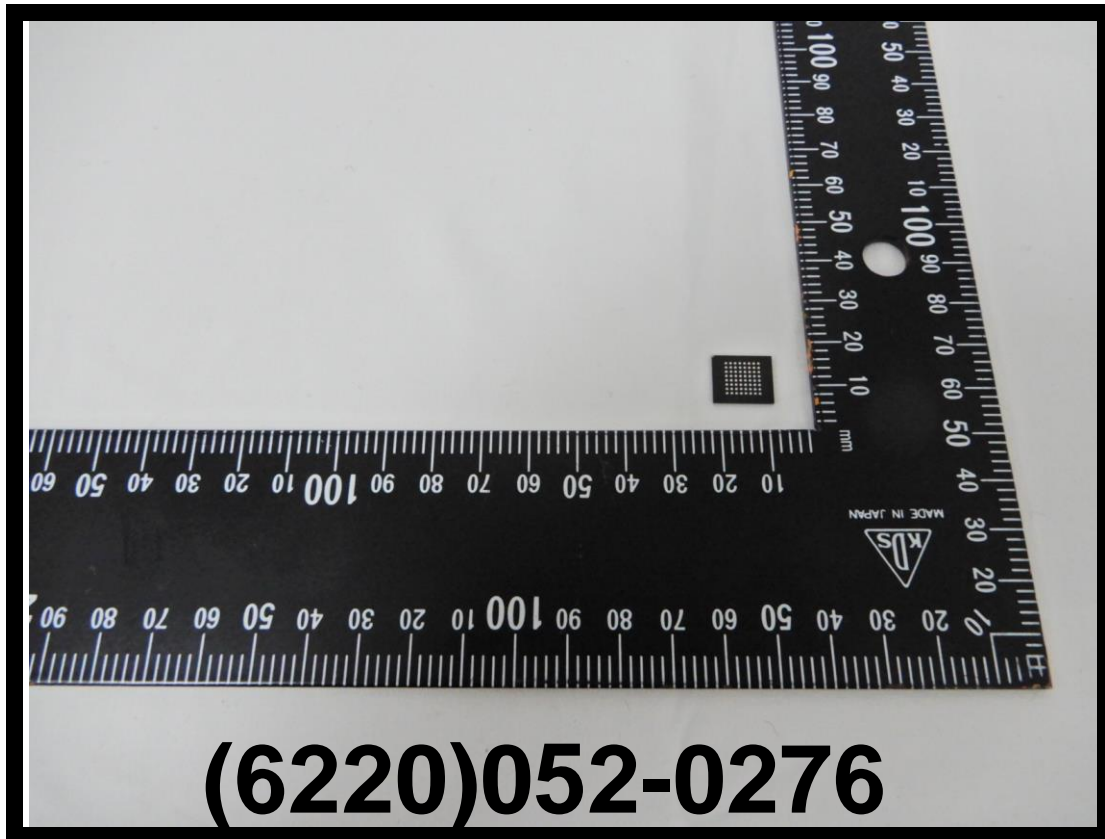
Photo of the Submitted Sample 委送样品照片

Lab No. : (6220)052-0276 Date : March 03, 2020 Page : 7 of 10